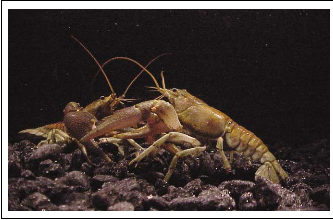
Figure 1. Two male crayfish Orconectes rusticus performing a series of chelae grabs trying to turn each other on to their backs.

fighting fish Betta splendens approach a winner more warily than they do a loser after viewing contests between neighbours [20]; rainbow trout Oncorhynchus mykiss settle a conflict faster with opponents whose fighting performance they had previously watched [21]. In the cichlid fish Oreochromis mossambicus , androgen levels increase in males while they are watching contests [22]. It has been suggested that androgens are the likely mediators of winner and loser effects that act by modulation of the cognitive mechanisms underlying animal communication [22].