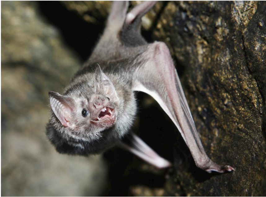
Figure 1. The common vampire bat ( Desmodus rotundus ).

Vampire bats are known to donate blood to conspecifics. New work shows that reciprocity rather than relatedness is the foundation of this example of altruism.